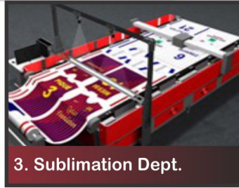
3. Sublimation Dept.