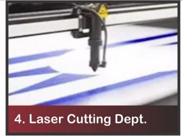
4. Laser Cutting Dept.