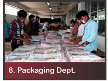
8. Packaging Dept.