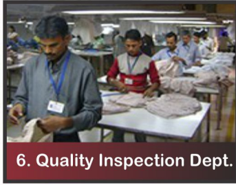
6. Quality Inspection Dept.