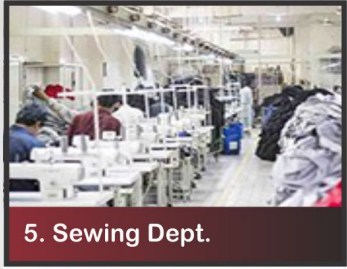
5. Sewing Dept.