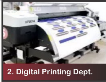
2. Digital Printing Dept.