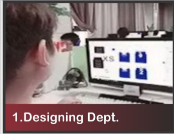
1. Designing Dept.