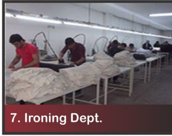
7. Ironing Dept.